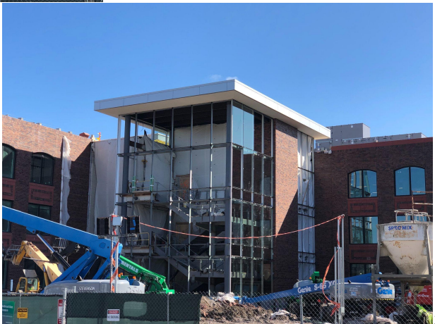
March 2023 Front Entry