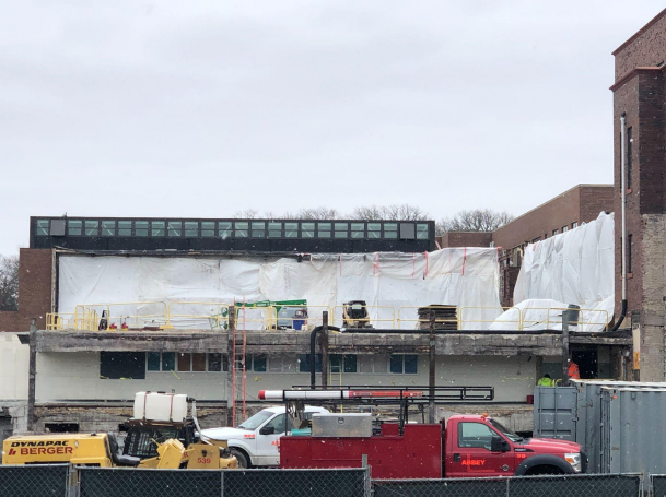
March 2022 Future Front Entry