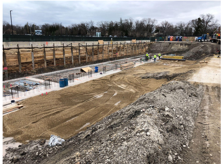
March 2022 Lower Field House Foundations